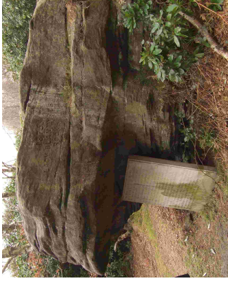
Lady Blantyre's Rock