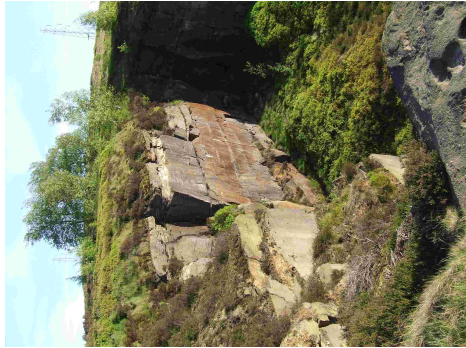
Old quarry working on open country - Long Lee